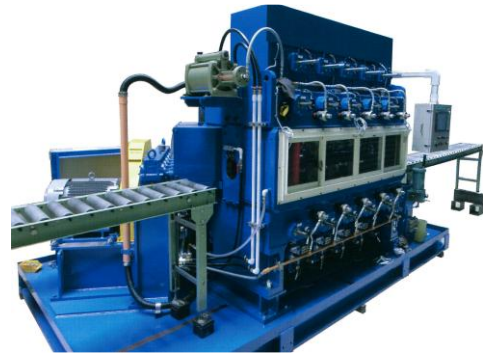
Kawazoe Machine Works flagship product: Straightening Machine

"Tube & Pipe Fair New Delhi 2025" is one of the largest exhibitions in India dedicated to the tube and pipe industry, covering metal, stainless steel, and plastic fields. The event brings together manufacturers of production machinery, processing technologies, materials, inspection equipment, and pipe fittings. This year, over 200 companies from India and abroad participated, introducing their latest technologies and various solutions.